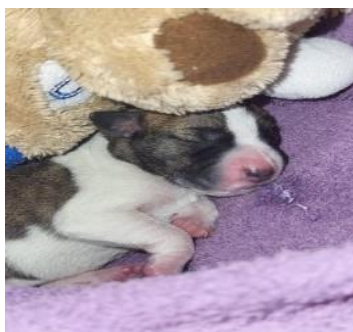
Tiabeanie just a few days old