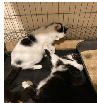
The Remi Brothers