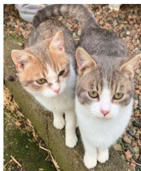
Chewy and Chomp